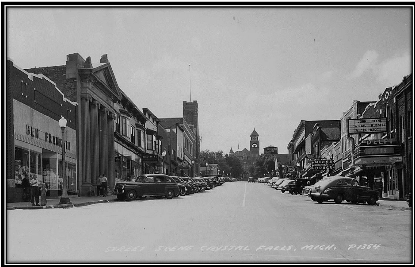
STREET SCENE CRYSTAL FALLS, MICH. 1934