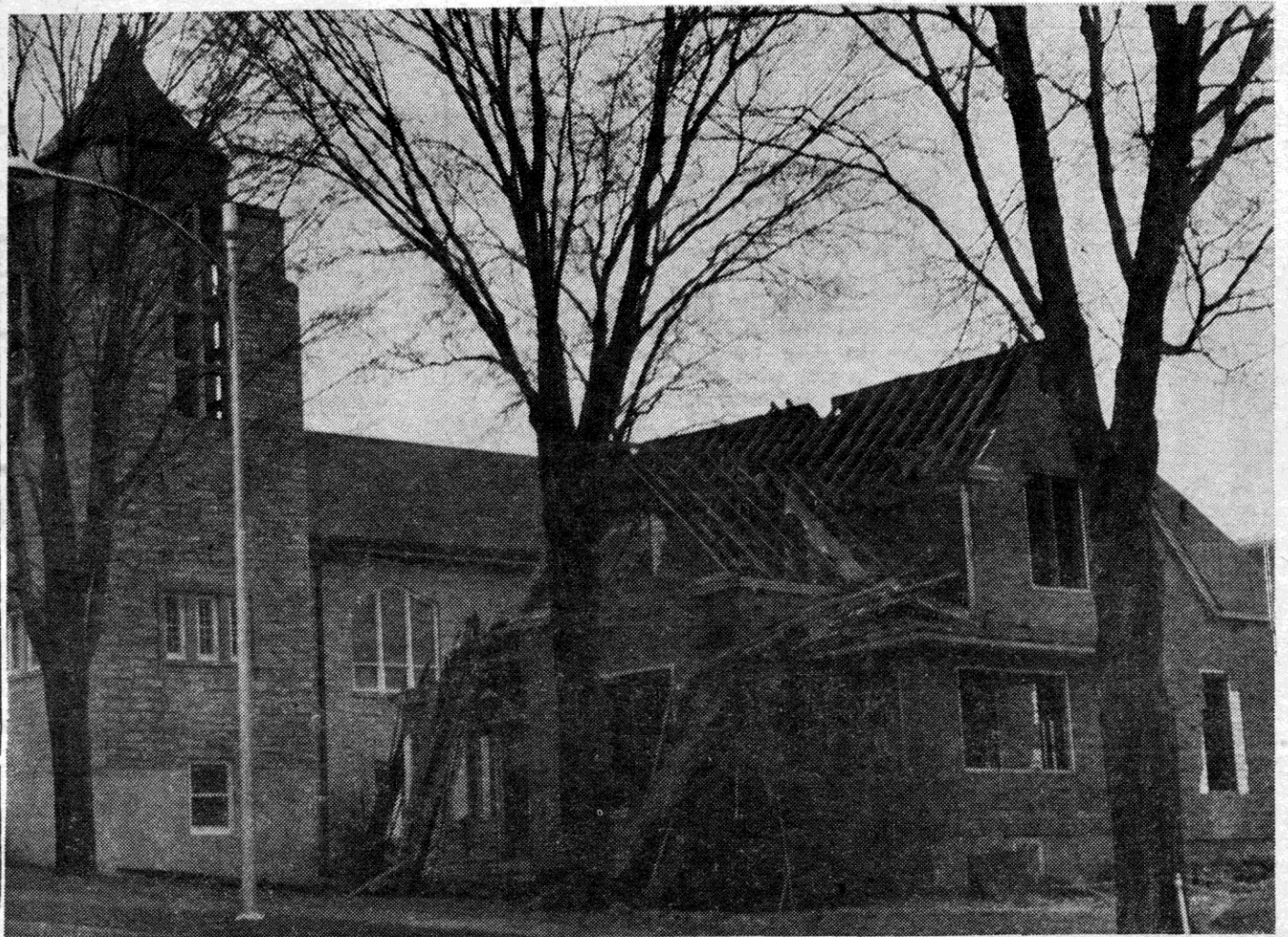
THE OLD COMES DOWN to expose the new. The ancient frame building which for over 60 years has served as rectory for the Guardian Angels' Parish is shown nothing more than a hollow shell as Walter and Phillip Skibo tear it down for salvage. When the building is torn completely down, it will expose the modern new stone building that was completed this spring by the parish and which is set far back on the lot, connected to the church by a glassed-in passage. When the last of the old house and its foundation has been cleared away, the lot will be attractively landscaped, to complete the rectory project.